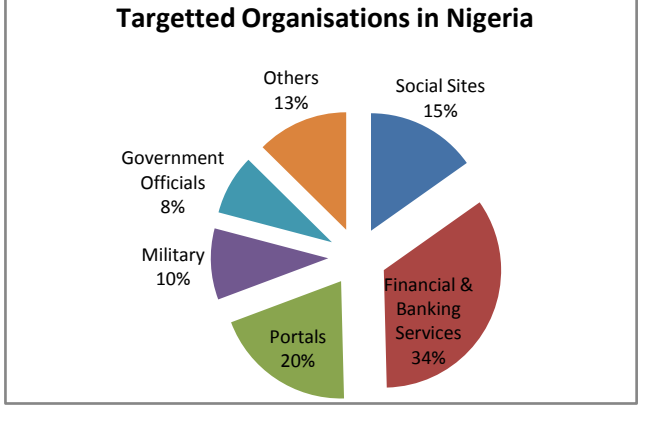
Figure 2. Targeted Businesses by Social Engineering Attacks